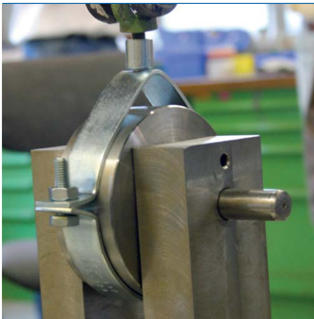
Testing a pipe clamp

Pipe clamps form the heart of any pipe mounting. They are practically ubiquitous in the field of installation, although they are often treated neglectfully. The pipe clamp is a good example to demonstrate the importance of a uniform, reliable and comparable evaluation process. Let us look at the simplest mechanical characteristic: behaviour under static, central tension the ultimate burden for a pipe clamp.